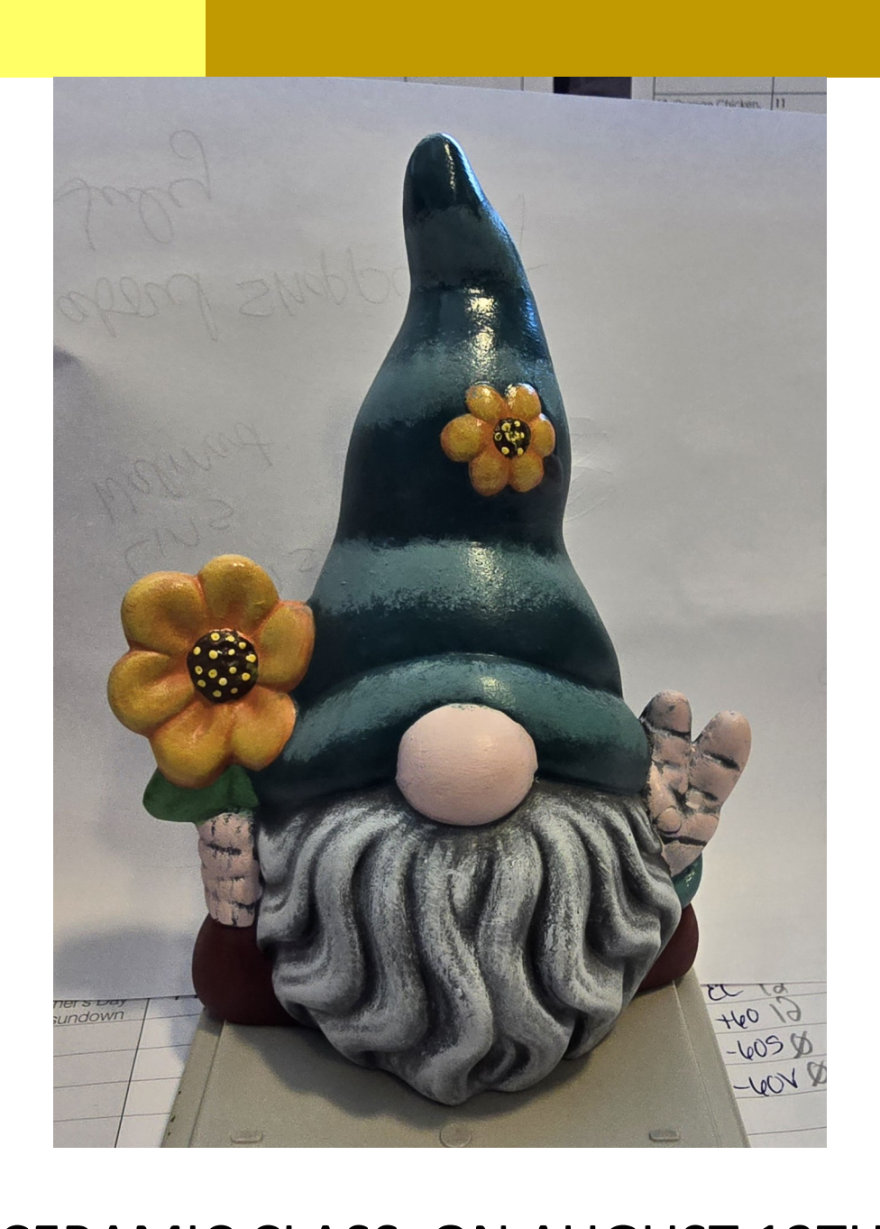
CERAMIC CLASS ON AUGUST 13TH PLEASE PREPAY $15.00 PLEASE PAY YVONNE IN CERAMIC CLASS